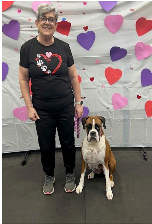
Gracie Lando N' Rockets Footloose N' Fancy Free CD BN RE RAE NAP NJP OAP BCAT DCAT TKI CGCA Earned in 2024: OAP Owned, Trained/Handled & Loved by Pat Senne