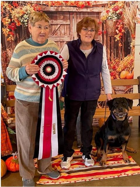
Teagan RACH Blackwood Princess of Claddaugh UDX TD RM RAE RM2 RAE2 CGC CS CI CS-T CI-T Earned in 2024: RACH RM RAE RM2 RAE2 Owned, Trained/Handled & Loved by Liz Hixon