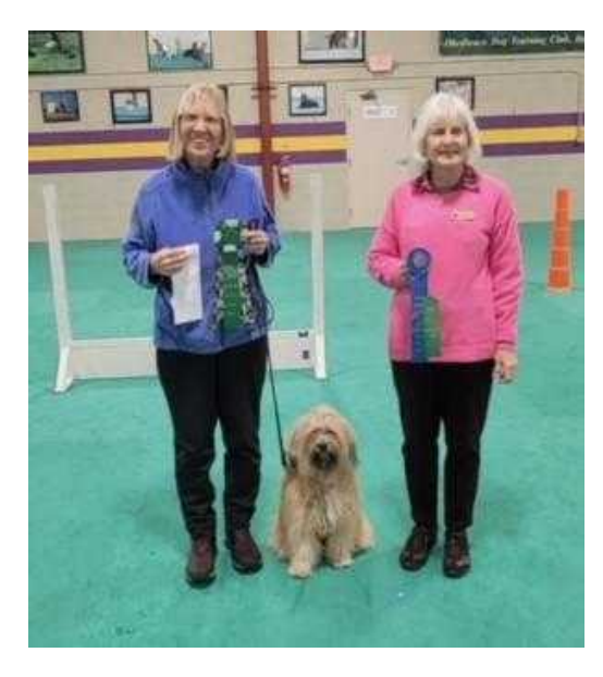
Buttercup DSCHO UTRAA' NYE-TSHOR CGC CD CDX Earned in 2023 CDX Owned, Trained/Handled & Loved by Cathy LaBash