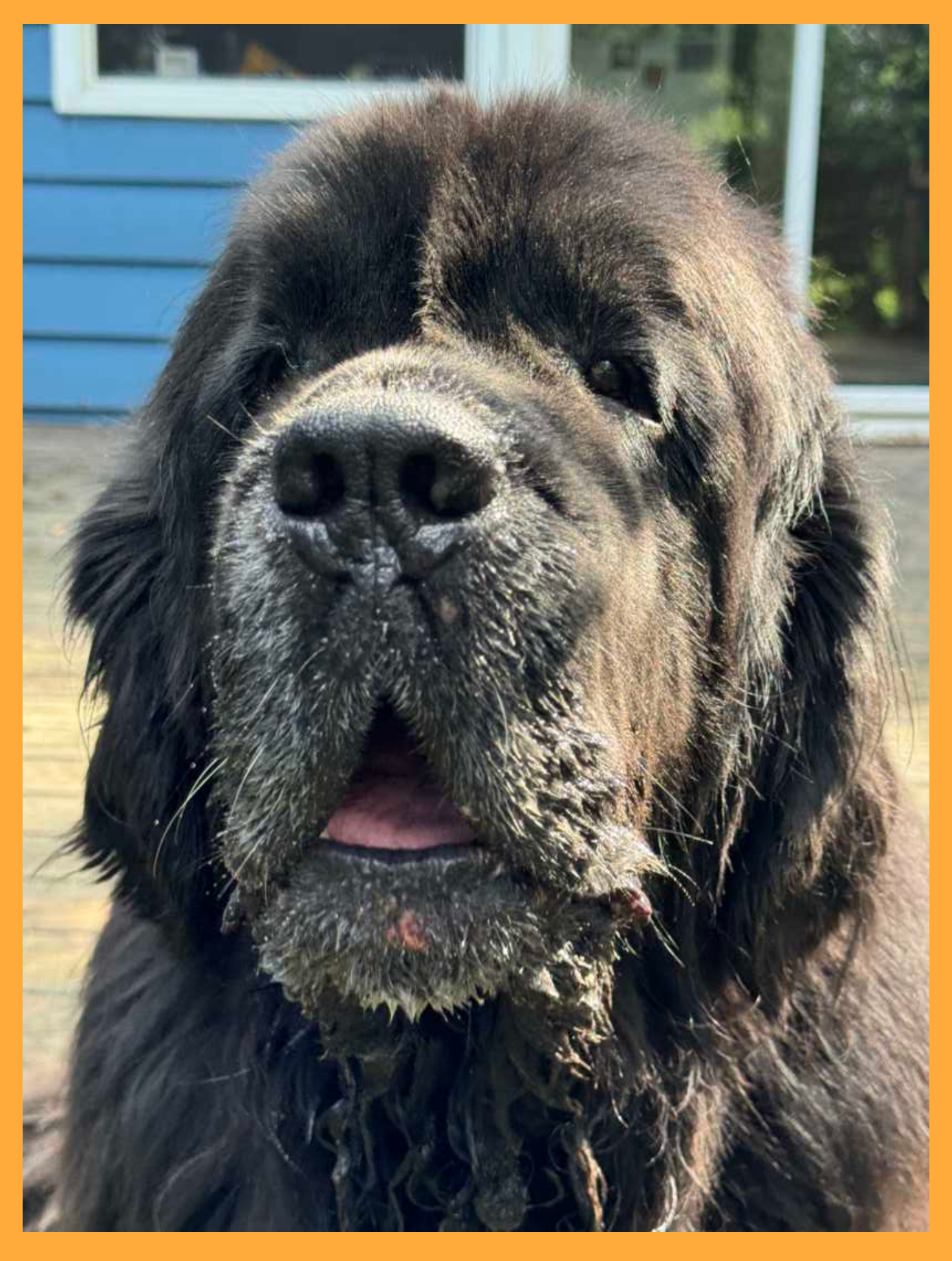
What's Up Says WELCOME FALL!!!